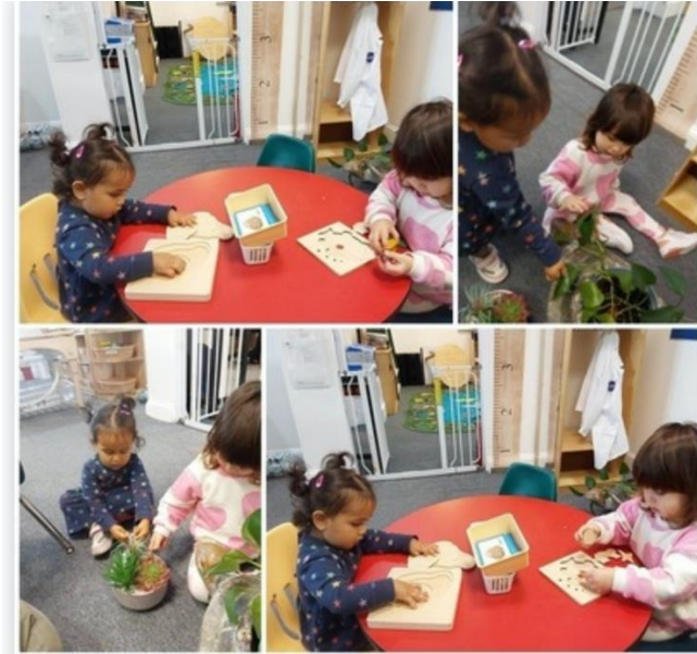
Living & Non-Living: Friends explored living and non-living items.