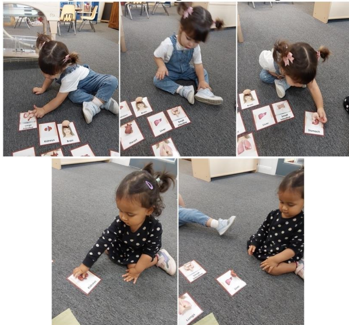
Organs: Friends were learning about the anatomy of the body. They were introduced to body parts and learned about their functions.