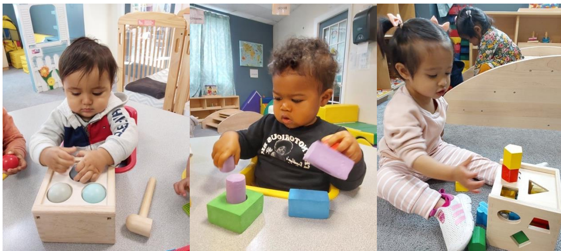
Children are learning about numbers by stacking blocks.

Children examined apple seeds and tasted apples. We counted seeds together and made predictions about how many seeds were in the apples.