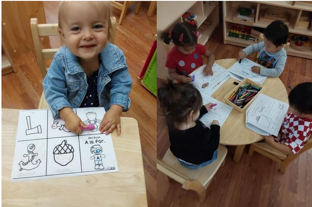
Friends wrote books about themselves and focused on the letter A.