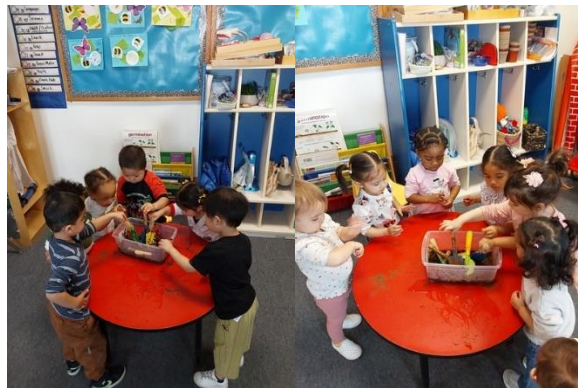
Making Mud: Children made mud together.