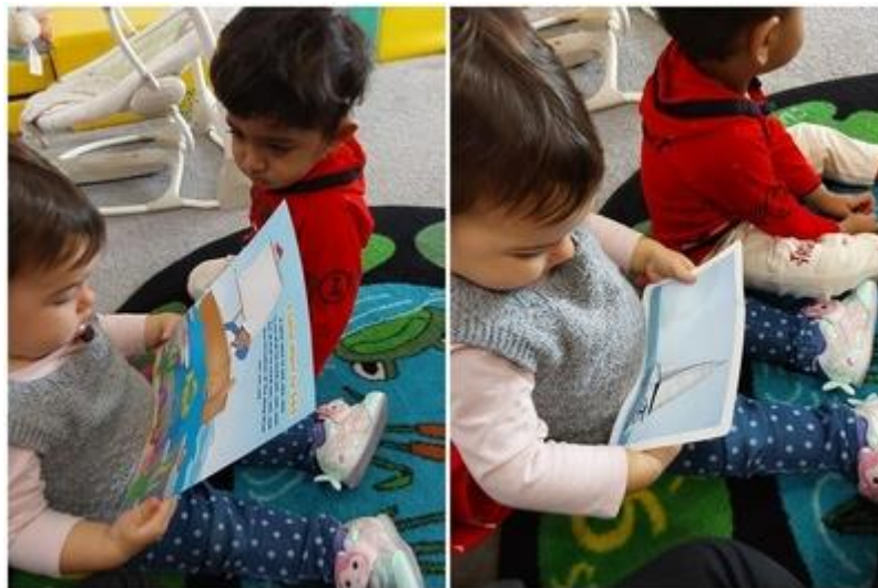
Boats: Friends explored boats and recited a song