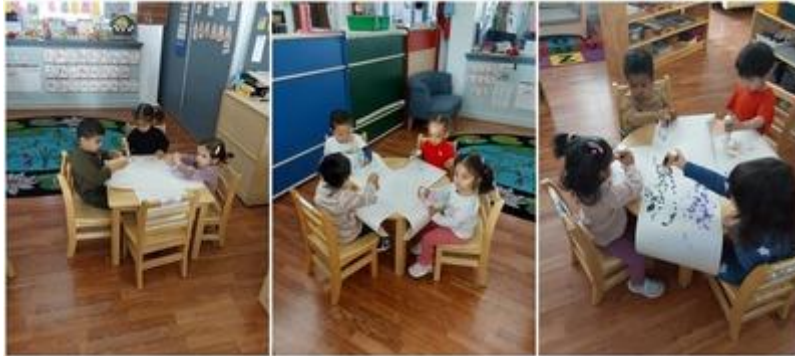
Making Dots: Friends were introduced to making dots.