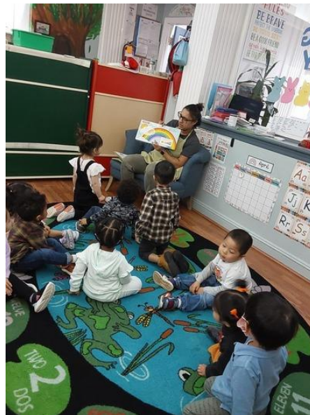
Spring Weather: Children talk about what spring weather is like.