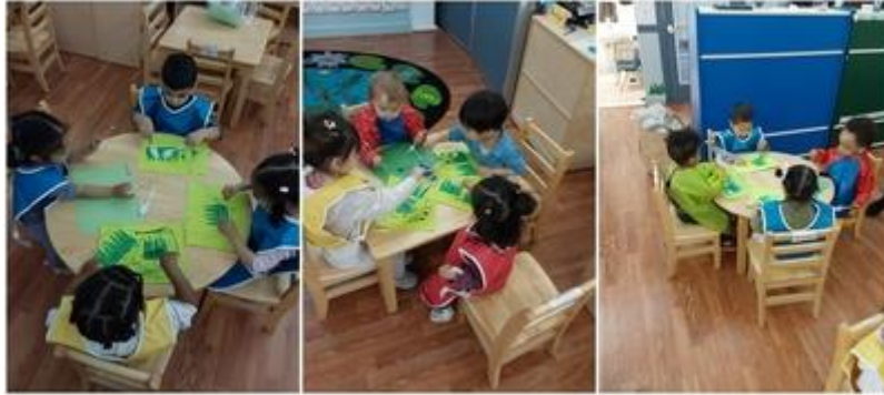
Rain on the Grass: Friends did a rain in the grass are project.

Children use their creativity through arts and crafts to foster their imagination.