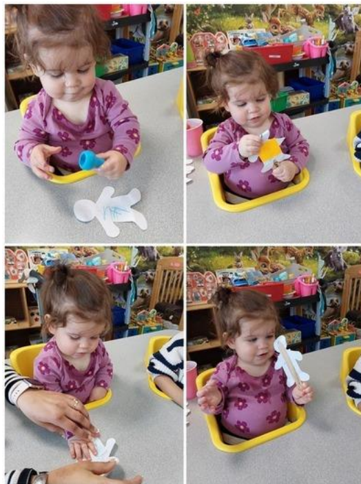
Wear-a-Life-Jacket: Friends made a puppet wearing a life jacket.