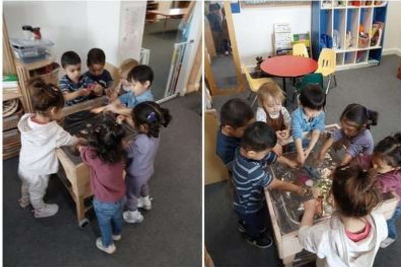
Water Sounds: Friends explored water sounds.

Children explore through observing and curiosity to discover science.