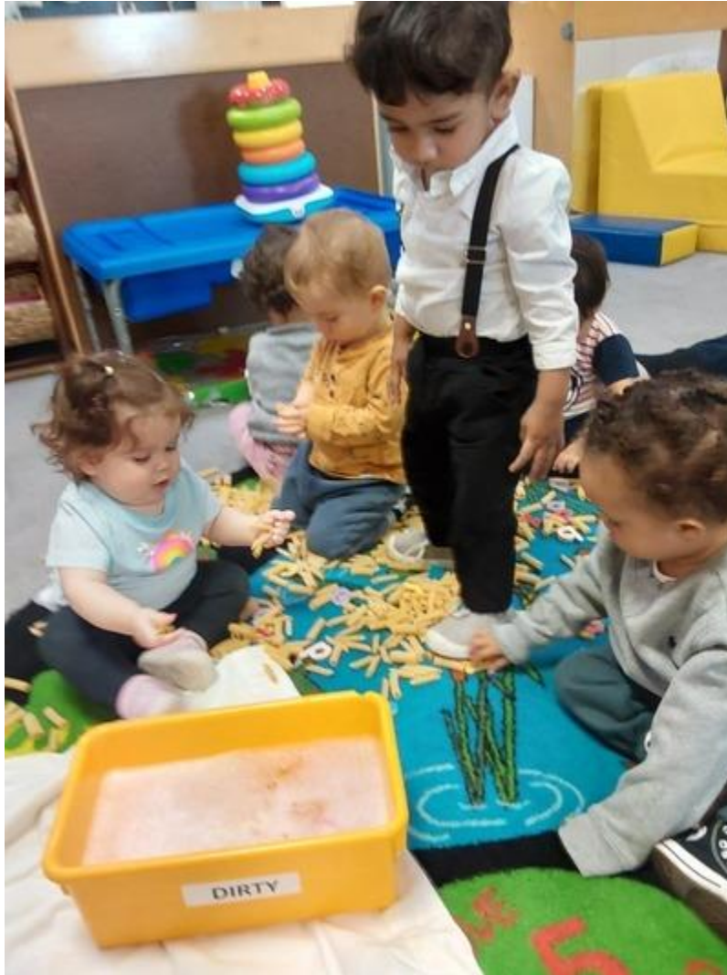
Sparkly Clean: Caterpillar friends worked together to wash materials.