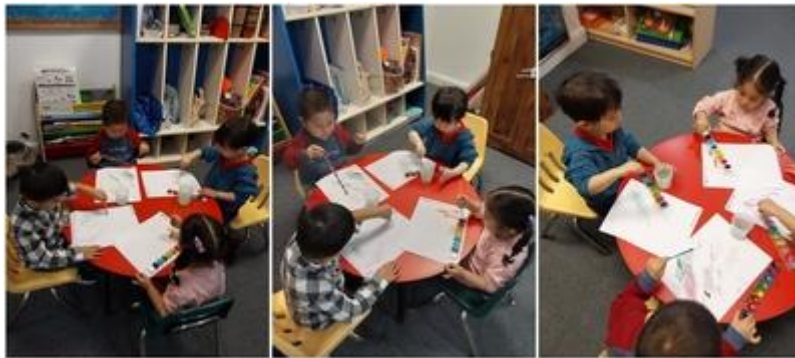
Rain Painting: Friends made beautiful pictures with watercolors.