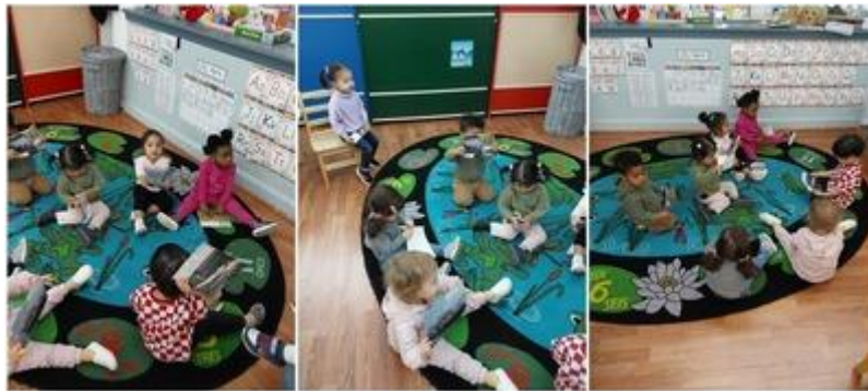
Boats: Friends learned about all the different kinds of boats.