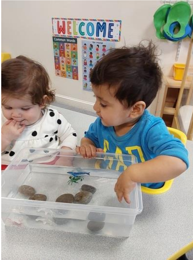
What floats? Friends explored water and floating materials.