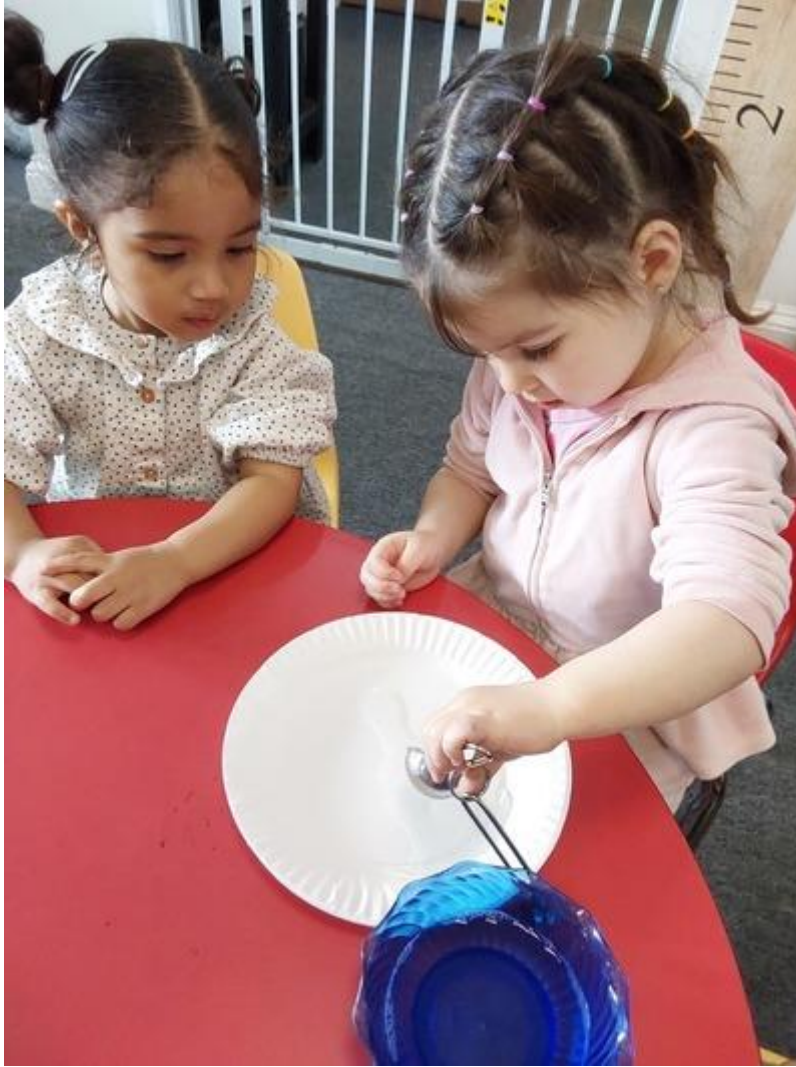
Puddle Possibilities: Friends discovered how puddles are made.