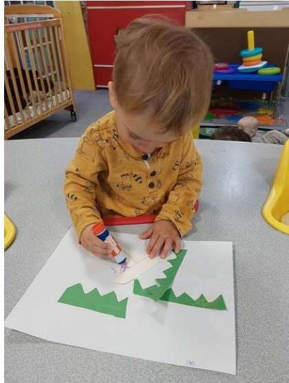
Sailing Sailboats: Friends used ric rac to make ocean-like marks on their artwork.