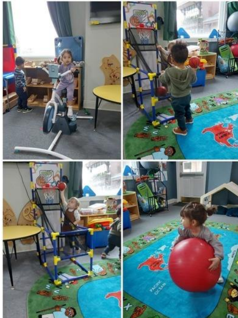
Friends enjoy playing together in gym and under the parachute outside.