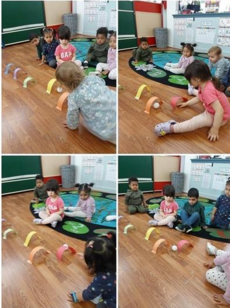
Rainbow Rollers: Children rolled a ball through the different colors of the rainbow and counted how many colors they made it through.