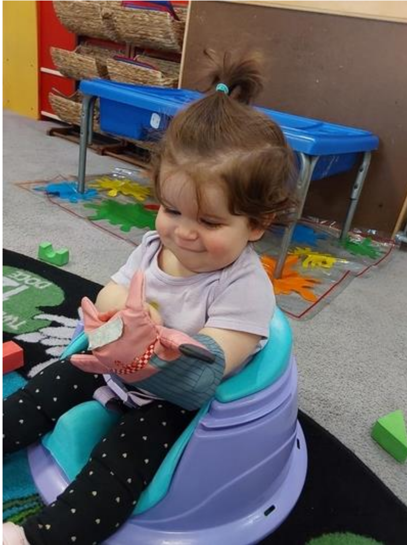
Puppet Play: Friends are learning to play with puppets to foster their imagination when telling stories.