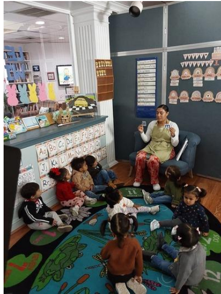
Letter M: Friends are learning about letter M and all things that start with M.

Language and Literacy development is essential to children because they build skills to communicate and develop vocabulary.