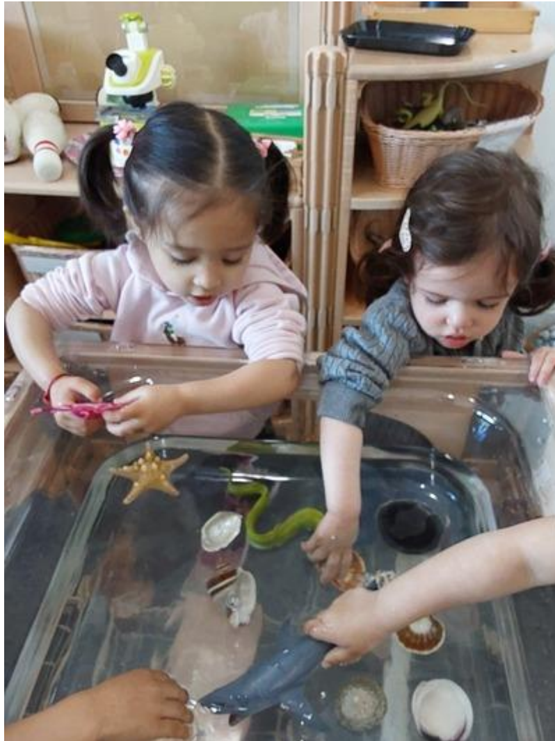
What Floats? Friends explored which sea animals sink or float.

Children learn to develop a foundation of their senses to better adapt to the world around them through exploring their five senses.