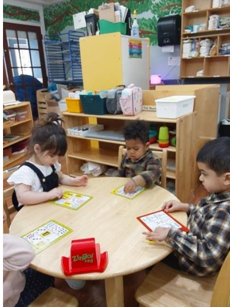
Math Zingo: Friends played math zingo to help them count and recognize numbers.

Children discover early techniques of mathematics by learning through counting, repetition, and number recognition. Children are learning to identify numbers.