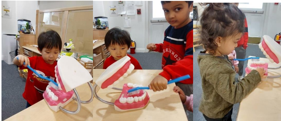
Brushing Teeth: Children used a toothbrush to scrub away at the teeth.

Children developed socialization skills, as well as language skills through play. This prepares children to build independence and life skills.