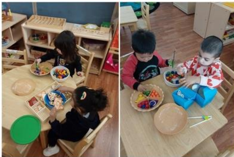
Kitchen Transfer: Children transfered food from basket to basket using kitchen tools.