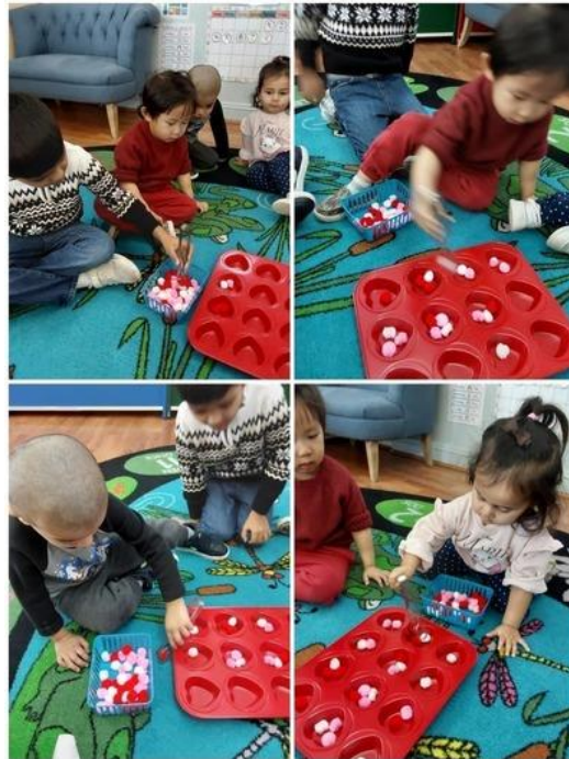
Scoop and Sort: Children scooped and sorted colored pom poms into heart shaped tray.