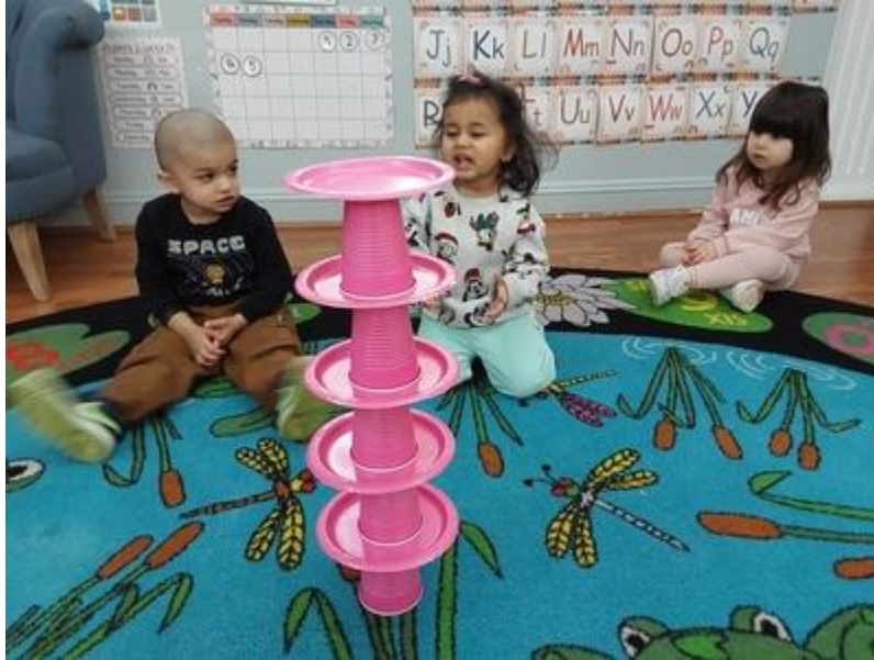
Stack & Count: Friends stacked plates and cups.

Children discover early techniques of mathematics by learning through counting, repetition, and number recognition. Children are learning to identify numbers.