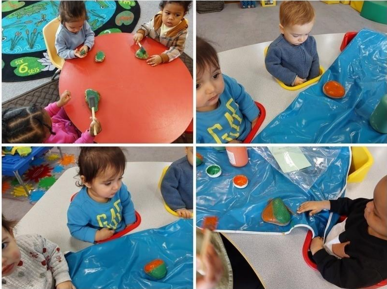
Rock Painting: Friends painted rocks to share with the community.