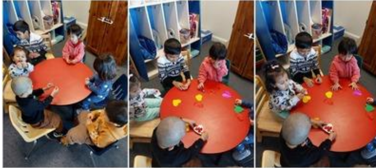
Tickly Textured Hearts: Children explored different textured hearts.

Children learn to develop a foundation of their senses to better adapt to the world around them through exploring their five senses.