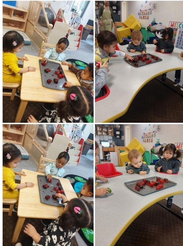
Ice Cube Painting: Friends used ice cubes with food coloring to paint a picture.