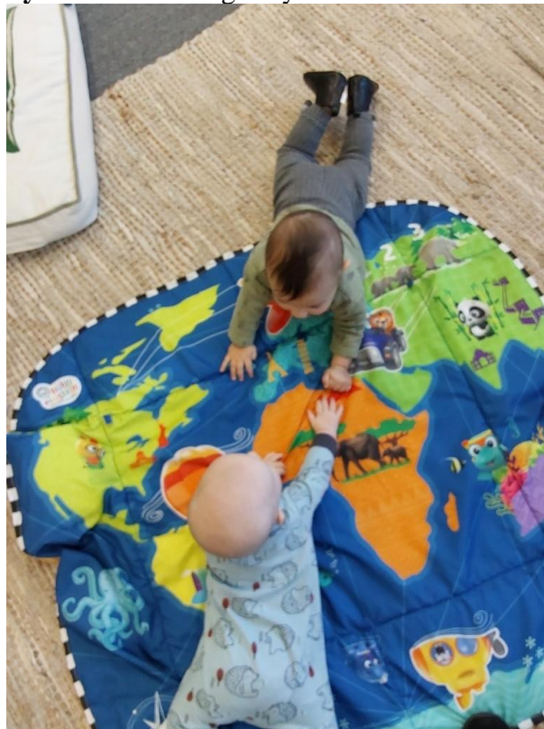
Dragonfly babies are developing social skills.