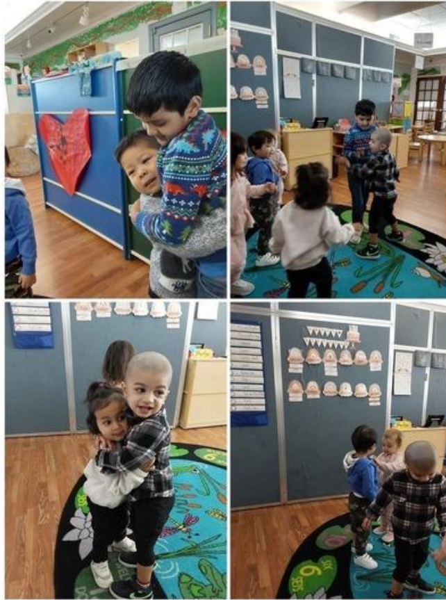
Hugs & High Fives: Children modeled kindness by offering hugs and high fives.