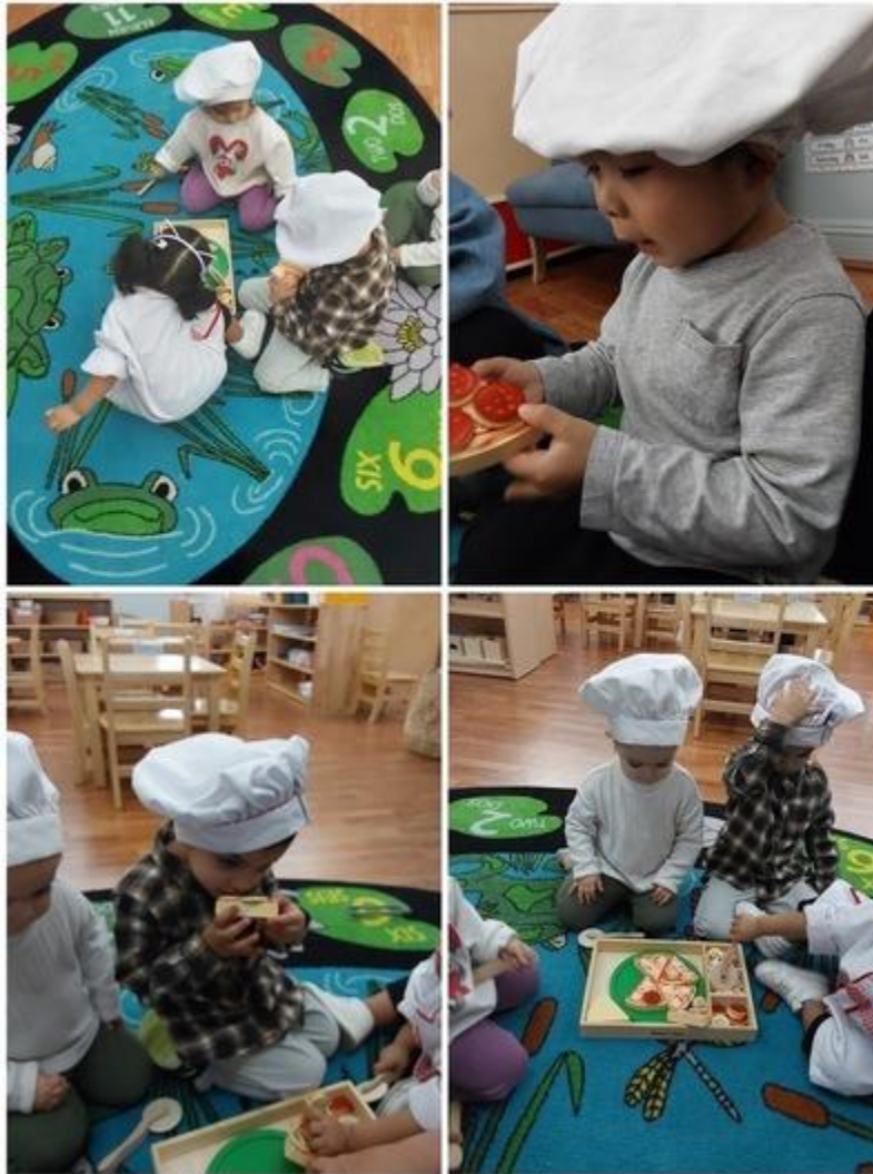
Making Pizza: Friend's pretended to be chefs and counted how many toppings they could fit on their pizza.