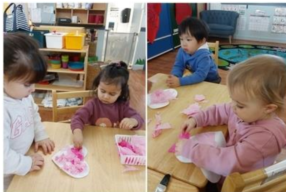
Sticky Color Sort: Friends pasted pink tissue paper to make beautiful hearts.