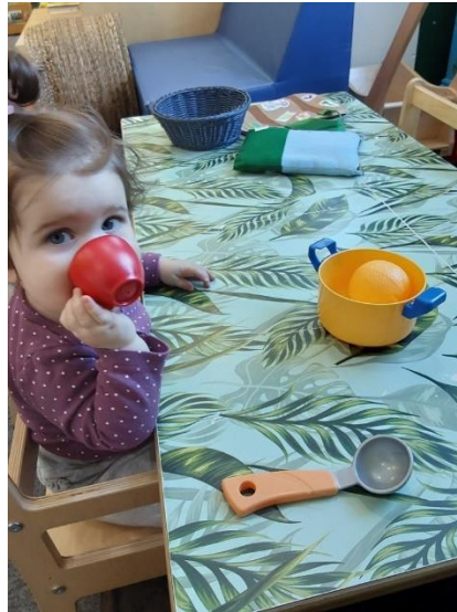
Tea Party Time: Our Dragonfly friend had herself a tea party.