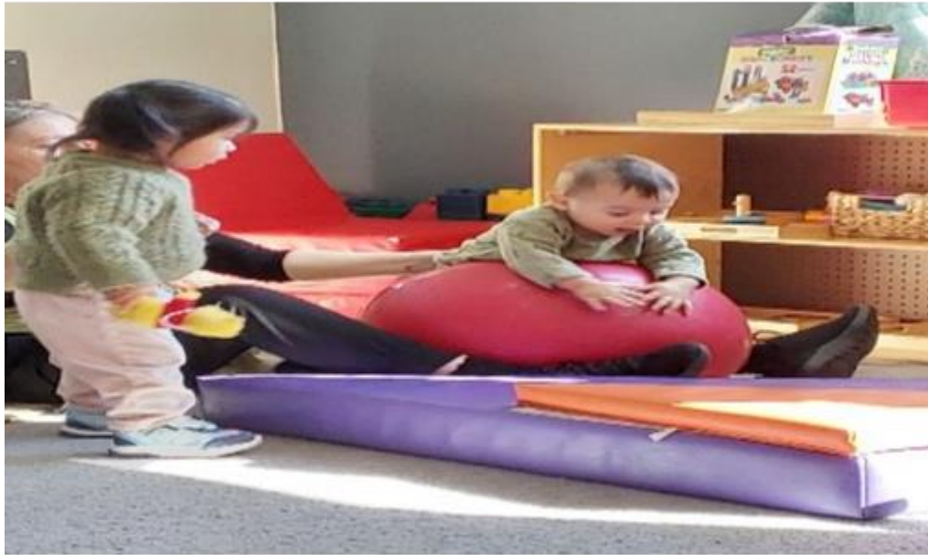
Dragonfly friend did core exercises on the red ball.