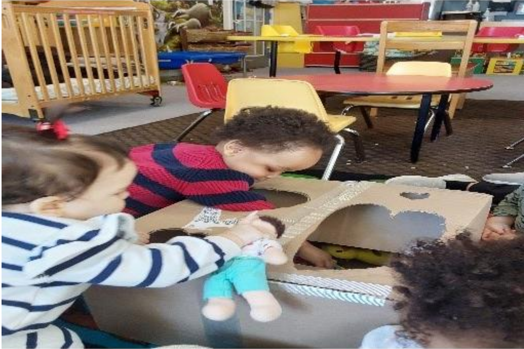
Friends inserted objects into heart shape slots.