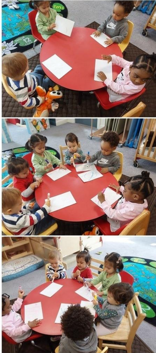
Heart Card: Caterpillar friends made heart cards using markers and heart cut outs.