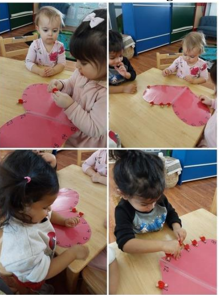
Friends match the numbers on the heart.

Children discover early techniques of mathematics by learning through counting, repetition, and number recognition. Children are learning to identify numbers.