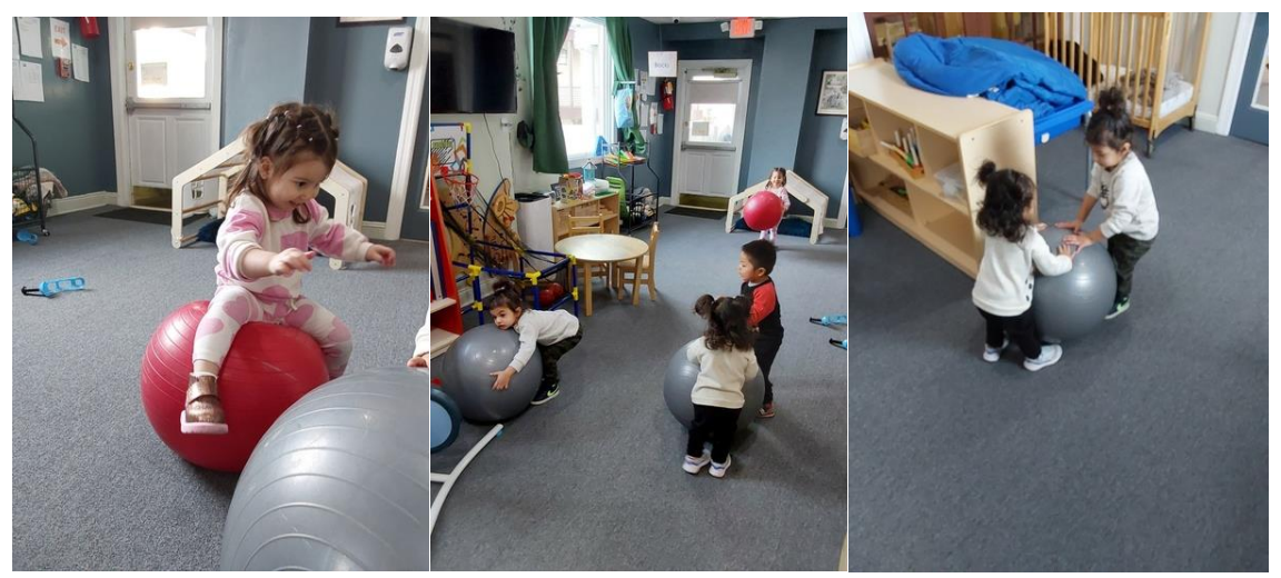
Rolla a Ball: Children roll a ball back and forth.