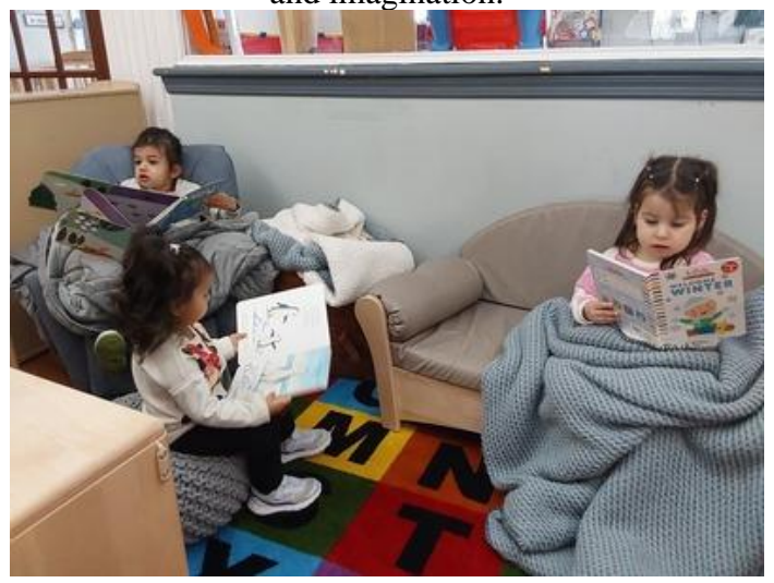
Friends got cozy and read books.

Teachers read to children and the children interact with books to help them with their literacy and imagination.