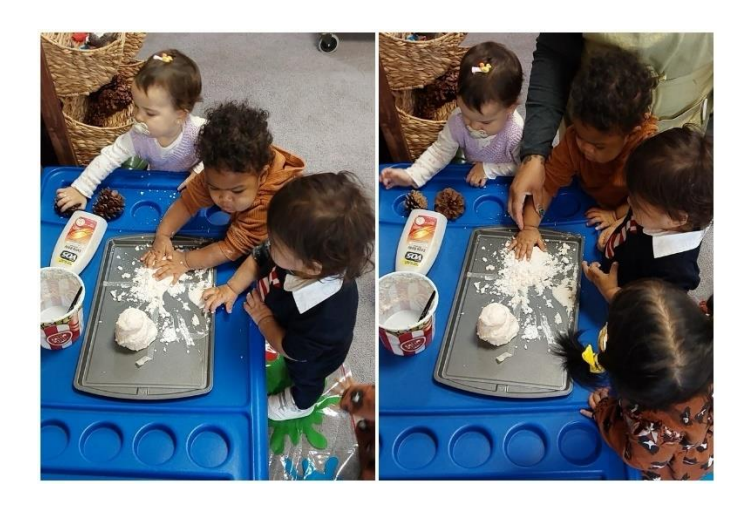
Sensory Bin: Winter Sensory Bin. Children explored the texture and created fake snow.