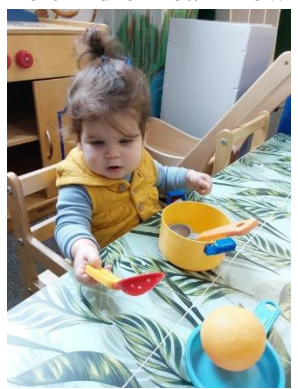
Kitchen Play: The child plays and explores pretend kitchen tools.