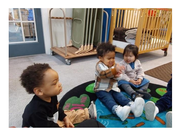
Circle Time: Children smile and talk to each other when their name is called.