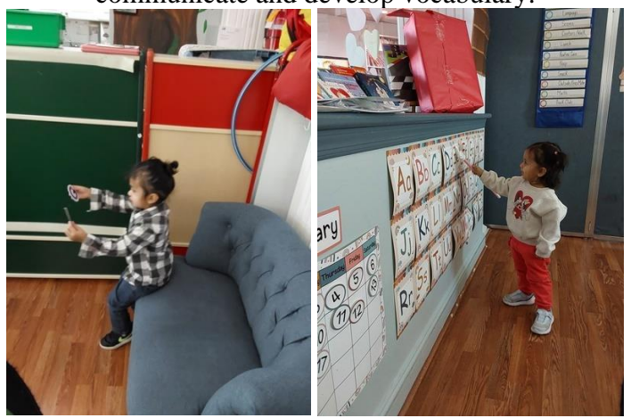
Letter G: Friends learned about letter G.

Language and Literacy development is essential to children because they build skills to communicate and develop vocabulary.