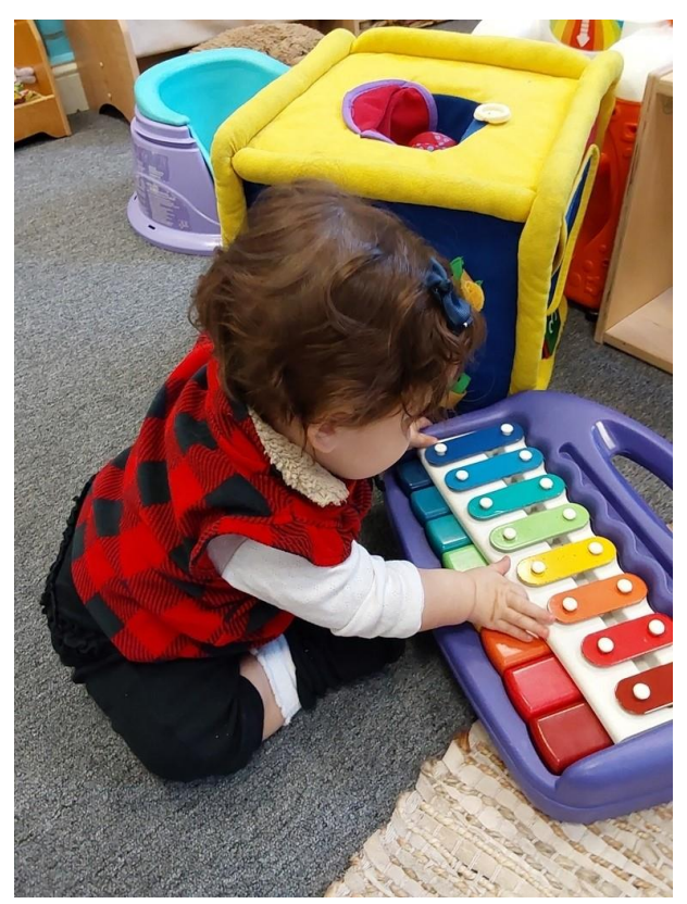
Playing Piano: Friends used their fingers to play keys on the piano.