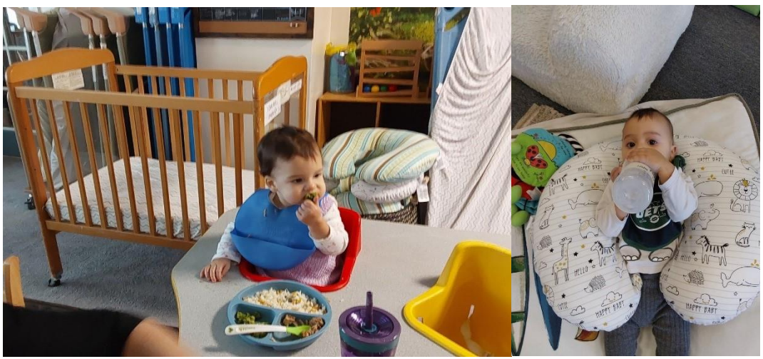
Feeding: The children learn how to self-feed.