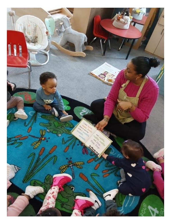
Children enjoy one of their favorite books during book club.

The child looked at pictures of animals and listened to the sounds each animal makes.