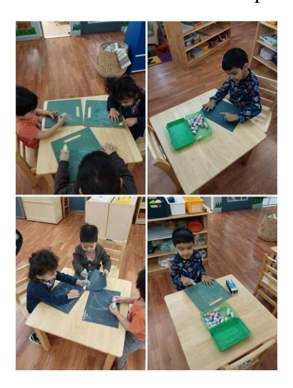
Chalk Experiments: Children use chalk in different ways.

Twisting Stamp Art: Children learned a stamp and twist technique.