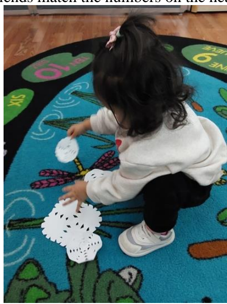
Counting and sorting snowflakes.